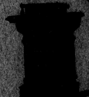
No. 16 Pulpit

SEND ALL ORDERS TO National Baptist Publishing Board