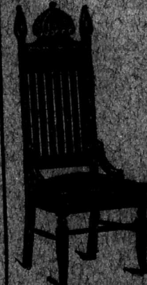
Chair No. 51