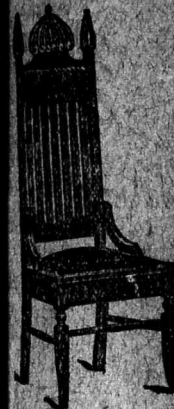
Chair No. 51

We can make you very at- tractive terms on this furni- ture.