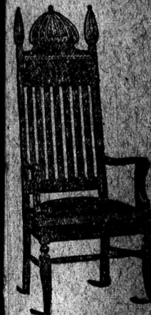
Chair No. 52