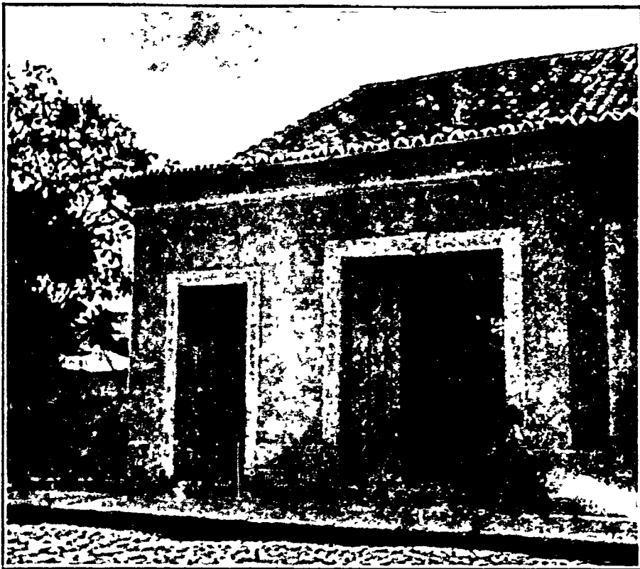
OUR RENTED HALL, NICTHEROY, BRAZIL.

ing them greatly. As to the publishing business, it is simply great and only needs adequate material equipment to be a truly