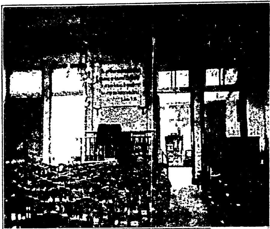
INTERIOR FIRST CHURCH, RIO, BRAZIL.

large suburb with fine prospects. The house belongs to the church, but soon it must be taken down lest it fall down.