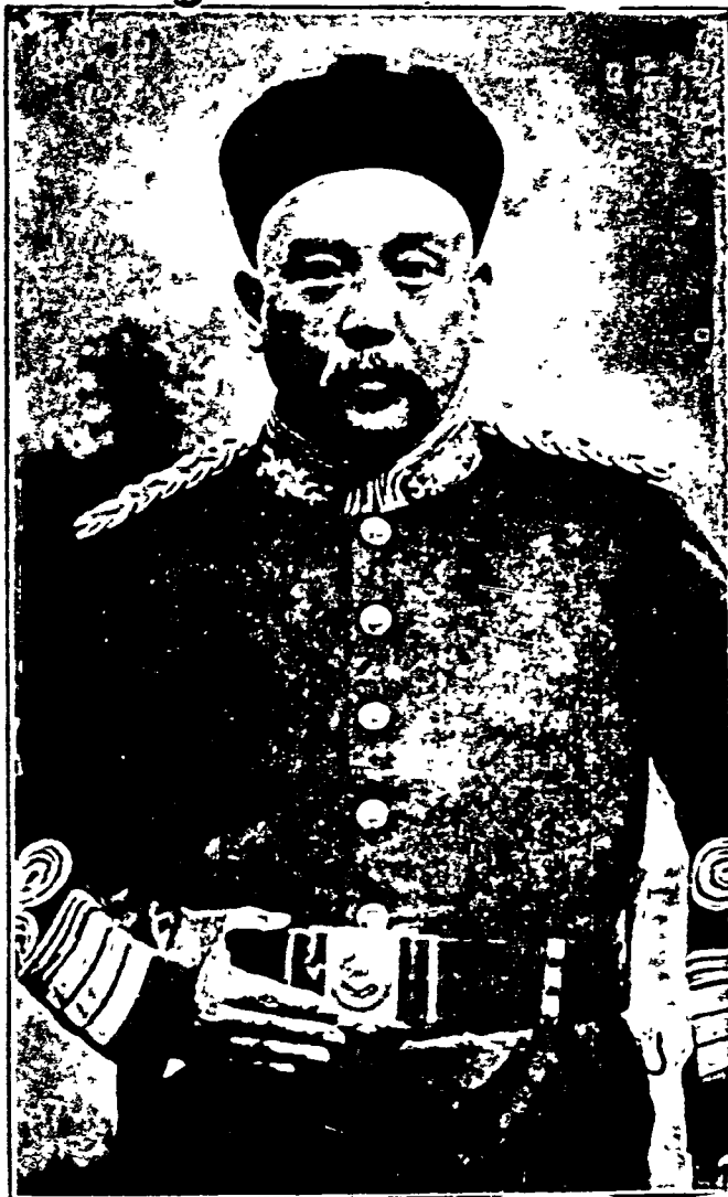
YUAN SHI KAI.

slowly as they dared. But another consideration just now is the series of un-