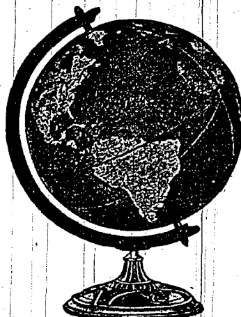
★ Large 12-inch semi-meridian globe in a new satin-brown finish. Base neatly designed and constructed to protect furniture from scratching.

SPECIAL OFFER DR. DODD'S BOOK AND THIS BEAUTIFUL GLOBE A $5.25 VALUE