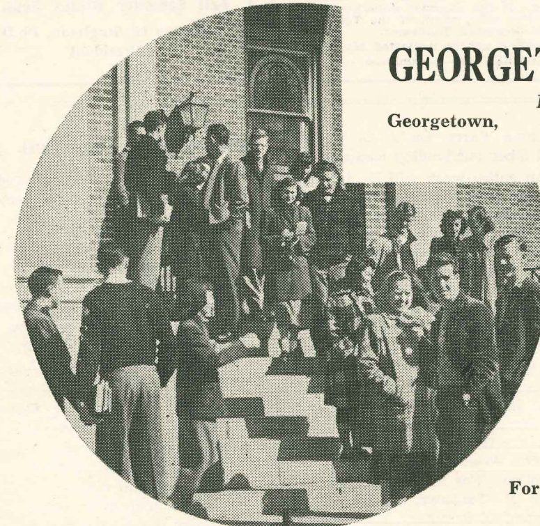
Students Leaving Chapel

On Georgetown's campus many a youth discovers that spiritual fineness is an imperative condition of true social witness . . .