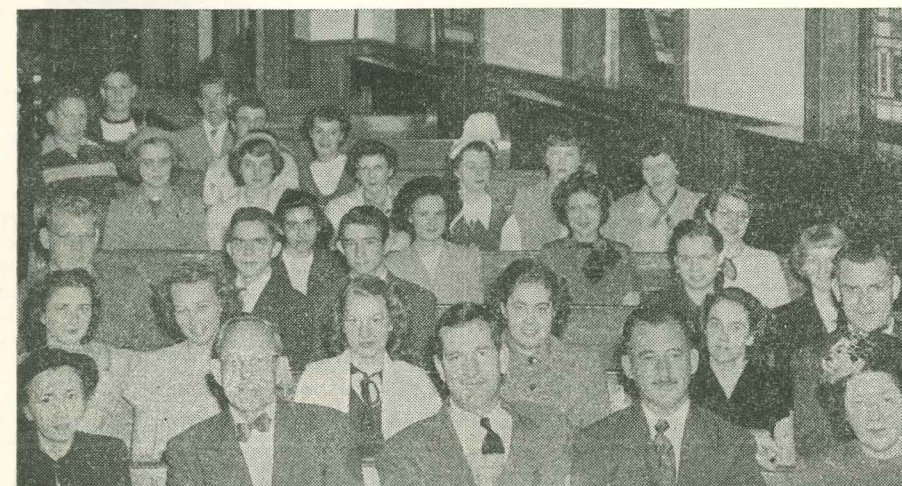
Department of Seventeen Year Pupils, Middlesboro

Someone sent us two examination papers on the books, "From Solomon to Malachi," and "From Joshua to David."