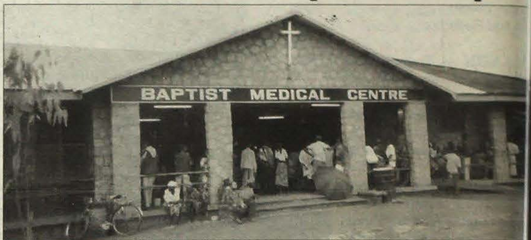
PATIENTS WAIT TO BE treated and family members of patients stand in front Baptist Medical Centre in Nalerigu, Ghana.

The hospital is staffed by four Southern Baptist missionary health care workers. They are helped by volunteers, medical residents, and